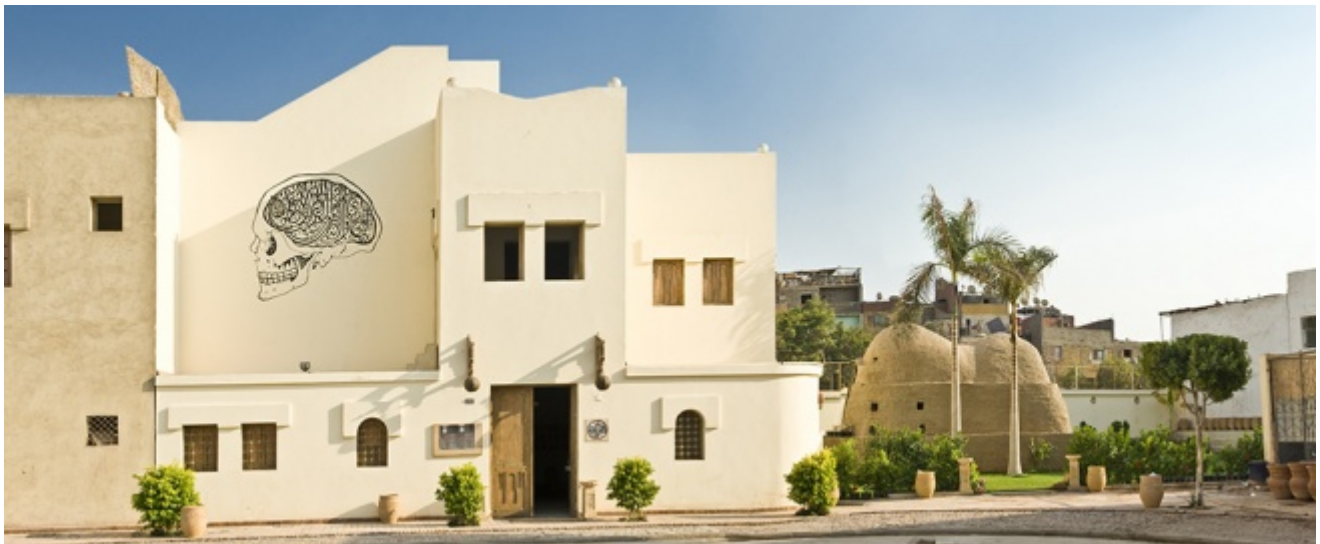
Darb 1718 Contemporary Art and Culture Center in Cairo

The scope and breadth of art programming in education in Egypt is miniscule. Contemporary art and critical writing are largely absent from the curricula of higher education. It is therefore not surprising that the artists of the Egyptian avant-garde, for example, have played a non-existent role in informing today's young art students. It wasn't until 2015 that an important conference on the Egyptian Surrealist movement presented a significant survey, for the first time, on a local art movement that would have otherwise been forgotten [3] . Many young artists in Egypt today rely quite heavily on the independent cultural institutions that provide workshops, lectures, screenings and spaces for exhibiting art. A new art discourse is taking form, a critical rhetoric, a reflective practice and, for the most part, it is not happening in our universities.