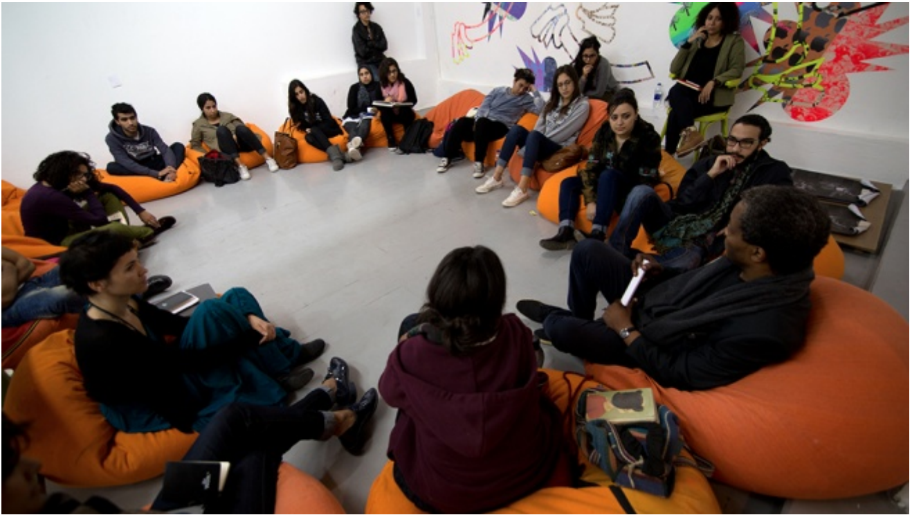
AtWork workshop at Darb 1718 Contemporary Art and Culture Center in Cairo

Why is this important in Egypt? AtWork allows artists to look inwardly and say something about themselves. It provides a space to speak openly and honestly at a time when Egyptians are told that their voices do not matter. Their voices do matter. The United Nations states that artistic expression is an “essential component of human development” [4] . They frame it as a human right. When authorities threaten their citizens against asking questions and further utilize censorship to gain a stronghold on how societies function, it is more important than ever to provide a platform that nurtures creative and critical expression. Therein lies the power of projects like AtWork which pinpoint the crux of the problem; they quite simply provide a reflective space for critical thinking and experimentation, one that is crucial for those societies which are increasingly being silenced.