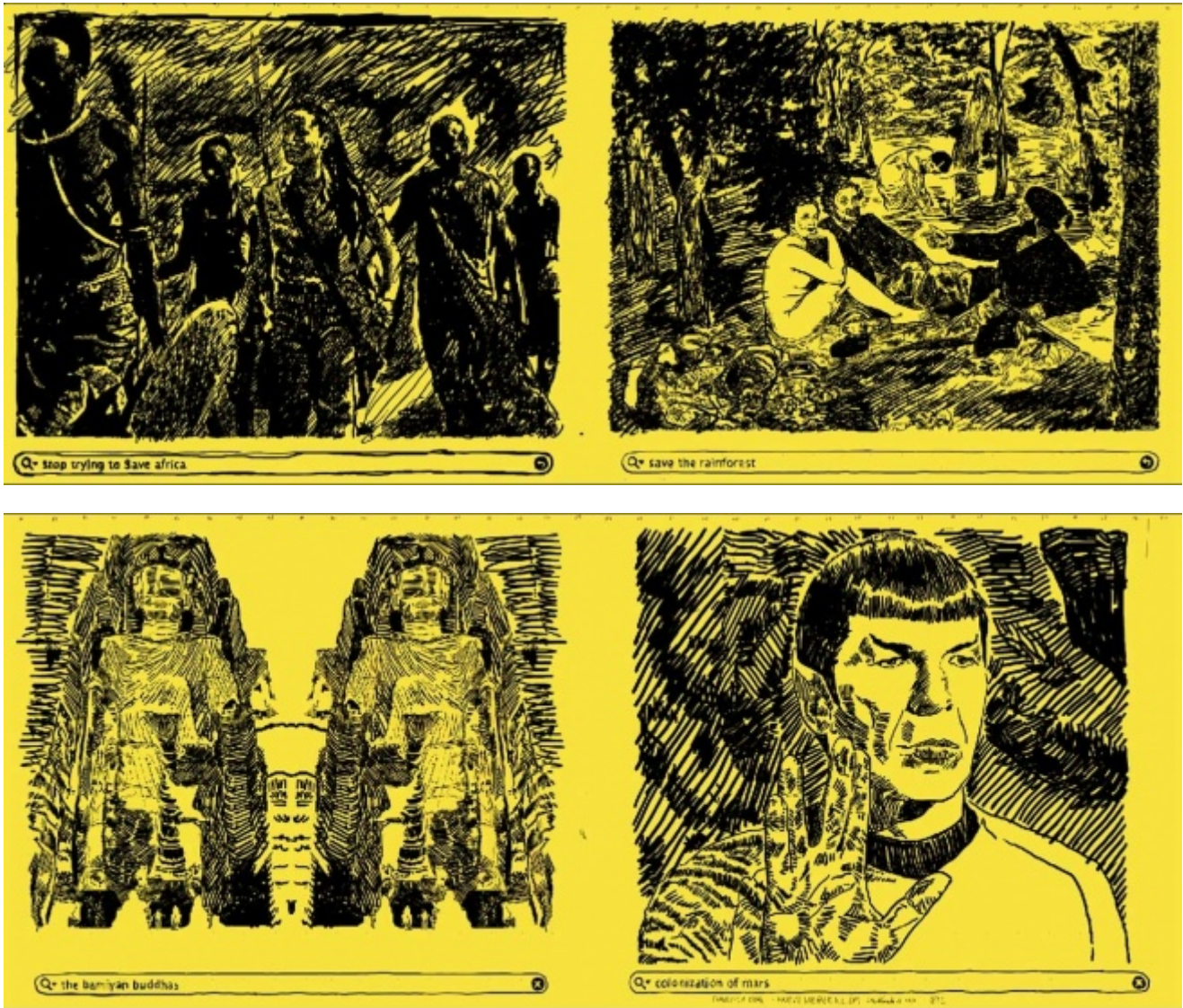
Francisco Vidal. Post-it series, 2010.

The recent success of Chagas and Mosquito, has in turn highlighted the fact that there is a wave of growing interest in the local art scene. This sentiment is reinforced by news of Luanda-based business magnate and art collector Sindika Dokolo's hopes of rallying the business and national energy sector- in an effort to return lost patrimony- to finance the buying back of 'African' artworks held privately and by museums in the West. It is also touted that, as the Foundation Sindika Dokolo collection continues to grow, Dokolo has plans to address some of the country's infrastructural shortcomings by building a museum in Luanda.