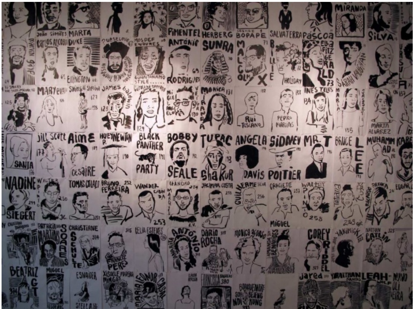
Francisco Vidal. Installation view.

Vidal operates a multi-disciplinary practice that includes drawing, sculpture and installation as a means to reflect upon the reality in which he lives. He has a vested interest in exploring notions of race, difference, negritude and the African Diaspora.