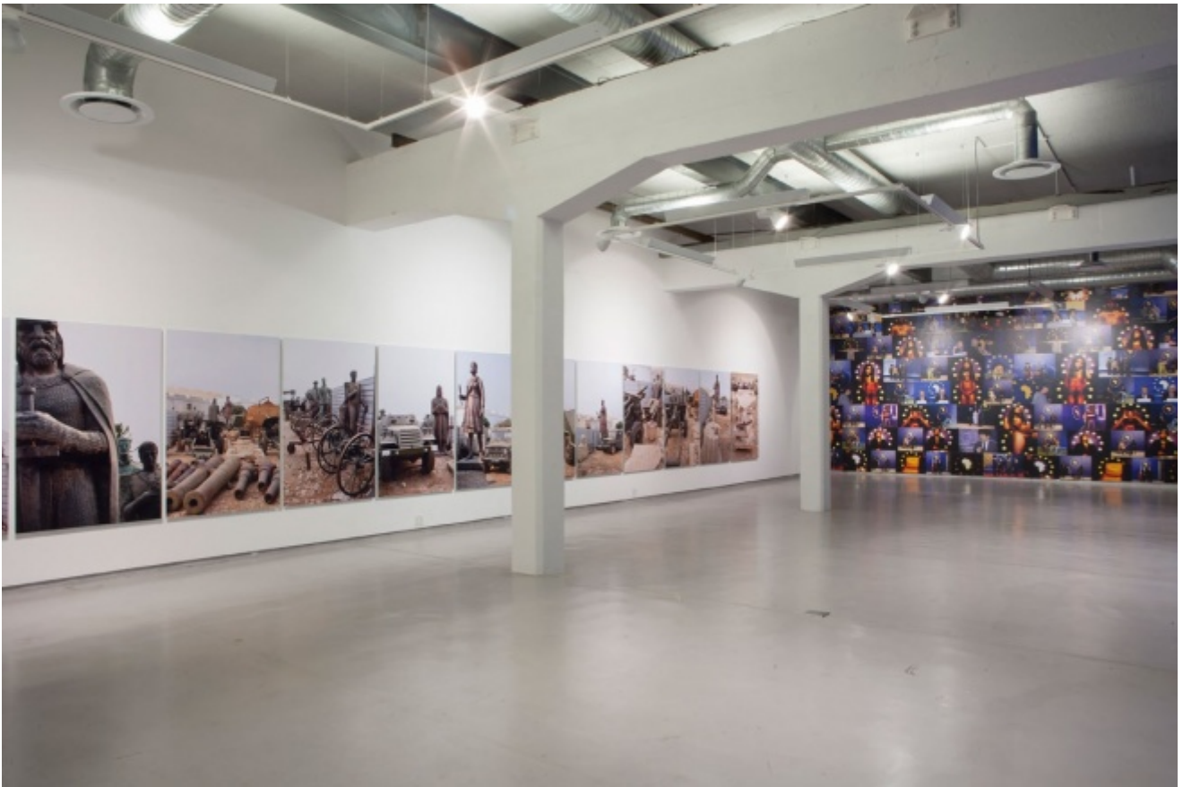
View of the exhibition (2014) KILUANJI KIA HENDA As god wants and the devil likes it

Utilising a predominantly lens-based practice, Henda's works speak to conceptions of Africa, its history and its future. His exhibition last September at Brundyn + in Cape Town, titled as god wants and the devil likes it , contemplated, "the aftermath of colonialism and its mark on the current Angolan physical, social and political landscape." It is exactly this method of investigation that examines the way socio-political histories shape both the present and the future, that has earned him many plaudits.