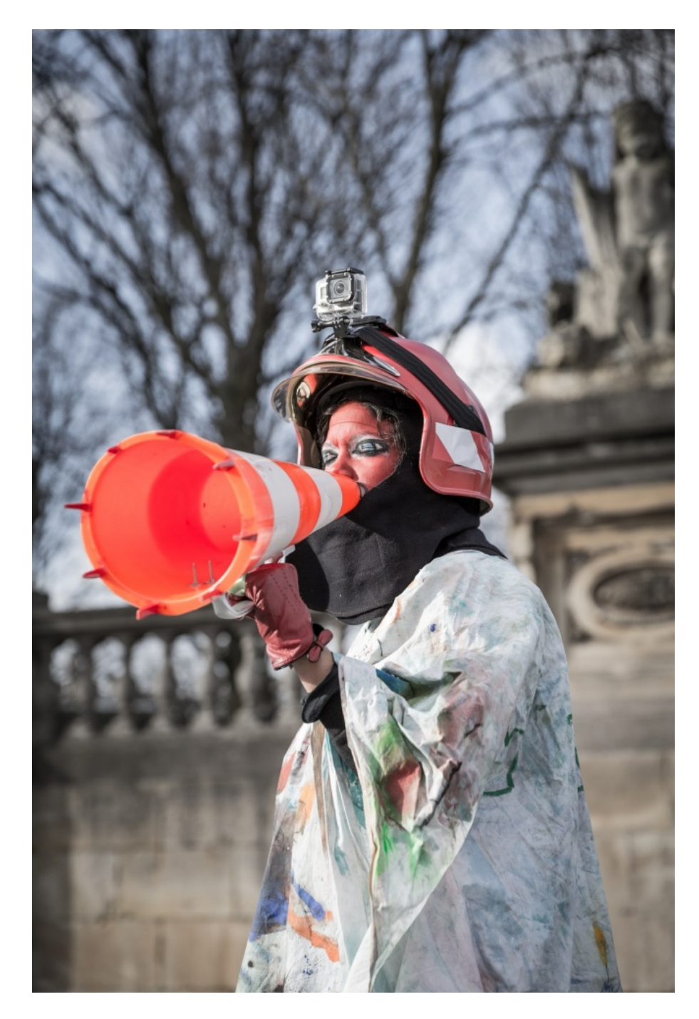
Tracey Rose, Tracings, 2015

Intense, cutting, provocative and highly political, this exhibition curated by Koyo Kouoh at Wiels in Brussels showcases the work of a generation of female artists from various regions of Africa who were trained in the late 90s, twenty years after post-colonial studies and the radical body-art performances of the 1970s, when the issues of feminism, gender and sexuality were being revisited and questioned by contemporary art practices. It no longer brings out the emotion, expression and "passion" of the Western body – the symbol of a century of turmoil, restlessness, atrocities, desires and madness – but focuses on the warmth,