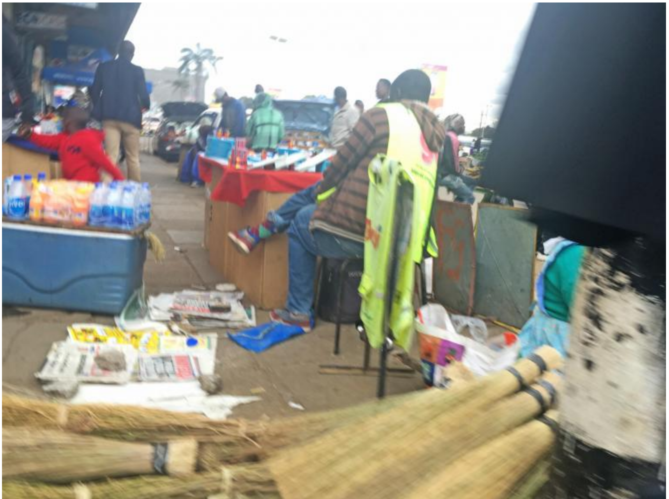
Harare city.

What you see downtown today is a perversion of this idea of space. In a tough economic environment where cash is hard to come by. Many people have gone into vending and occupy the vacant rooms, pavements and streets of the city. While this introduces cheap organic produce and clothes, it is also unregulated and can be a pain when you're trying to park for example. The spatial generosity has turned into spatial exploitation that is encompitable with the compact environment.