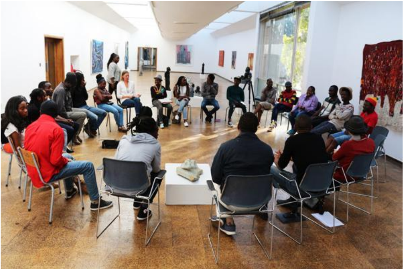
AtWork Harare, workshop at the National Hallery of Zimbabwe, ph Kresiah Mukwazhi.

The number of times I've stood in a queue and felt someones' breath on my neck or their chest on my back are too numerous to mention. Normally a glare would make most back off, but instead, a vacant expression free of any guilt makes you look weird for not wanting a complete strangers' body in your personal space.