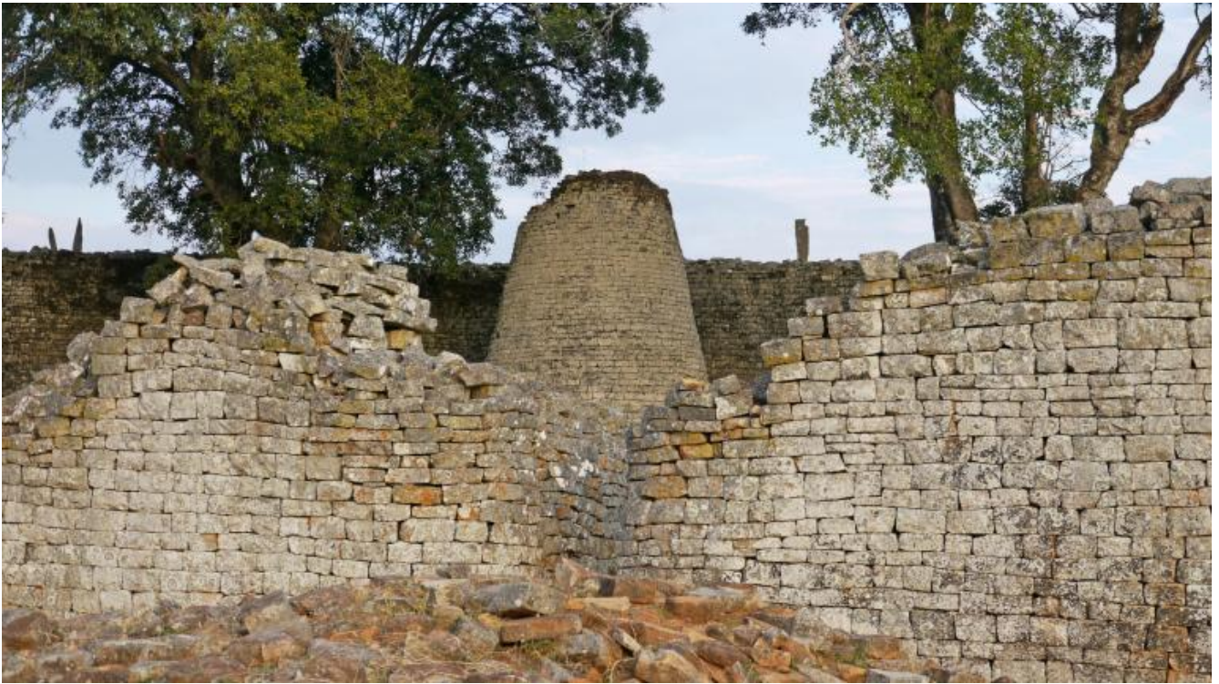
Great Zimbabwe

The bathrooms aren't that private either. While using the urinal, I had the feeling I was being watched and sure enough a man squatting down doing his business was staring at me. The lack of any barriers means that this type of situation is common.