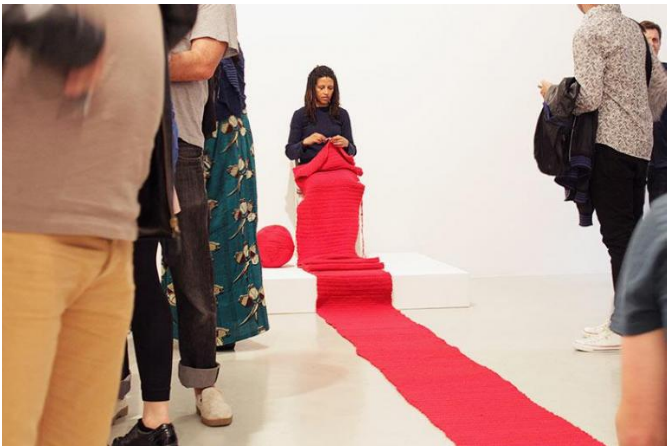
Lerato Shadi, Mosaka Wa Nako, performance at n.b.k, Berlin (2014)

Lerato Shadi: I guess because I experience everyday life as a series of repetitions. I find that repetition makes it seemingly simple but complex idea visible.