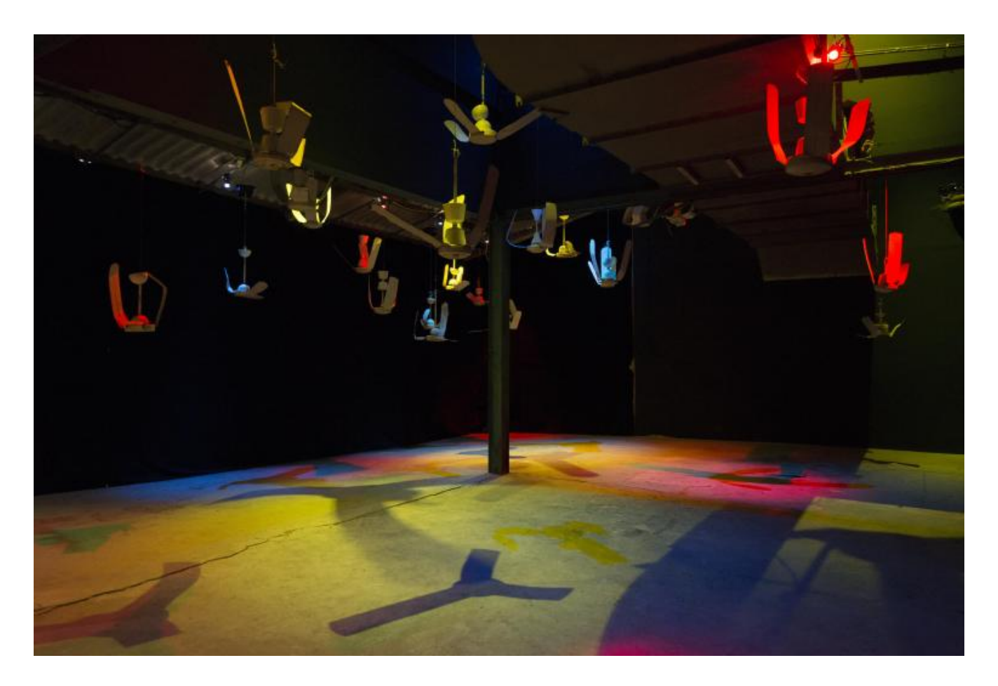
Pascale Marthine Tayou, La danse des ventilateurs, le vent..., 2012. Ventilateurs, motors. Variable dimensions. Exhibition view Voodoo Child - Galleria Continua / Les Moulins, April 2017.

We were wrong to think that the increase of sales or bids given to Africa was random. Better than that! A new generation of African businessmen and women realised the importance of the artistic creation in defining an identity and in the aesthetic and philosophical positioning of the independent and original African thought (the initiatives like Revue Noire have greatly contributed to this). I could also mention an initiative, in which I am involved with lettera27 Foundation in Milan. It's called AtWork and its objective is to give the young artists from the continent the intellectual tools to help them navigate this complex world.