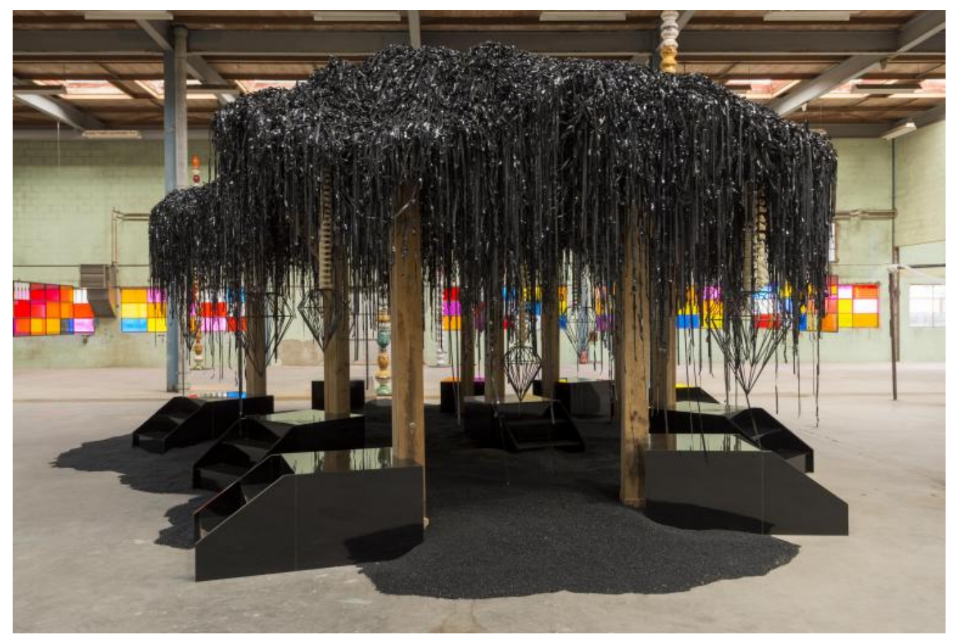
Pascale Marthine Tayou, Diamondscape, 2012. Wood, formica shiny metal structures, chains, resin, motors, cables, telephone wires and magnetic stripe. Variable dimensions. Exhibition view Voodoo Child - Galleria Continua / Les Moulins, April 2017 Courtesy the artist and GALLERIA CONTINUA, San Gimignano / Beijing / Les Moulins / Habana.