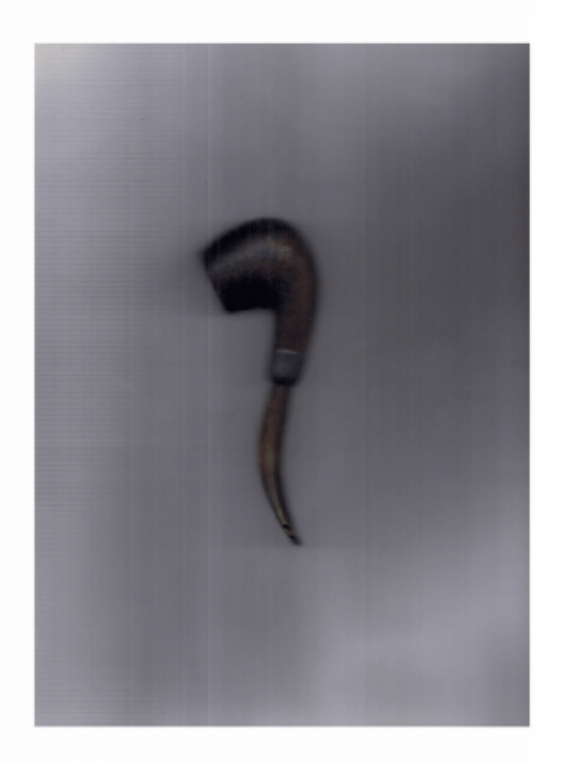
Abraham Oghobase, Ken Saro-Wiwa Pipe's (2016), Courtesy of the artist and Tiwani Contemporary.

Field Work –open until the 25<sup>th</sup> of February 2017– is a simple exhibition of difficult works, products of sophisticated artistic practices. The personal researches of the artists involved all attempts to grasp alternative ways of talking time and times, of investigating stories and histories normally neglected by western Historiography (with a capital "H"). The final aim is to reconfigure the methods of historical thinking, in the light of a comprehension of time that is anti-chronological and anti-hierarchical, so to create the possibility for alternative knowledges to emerge and spread. For the visitor, a walk around the artworks featured in Field Work is an occasion to sharpen the gaze and become acquainted with narratives of the past that, although marginalised or forgotten, survive in the present and continuously act on our contemporaneity.