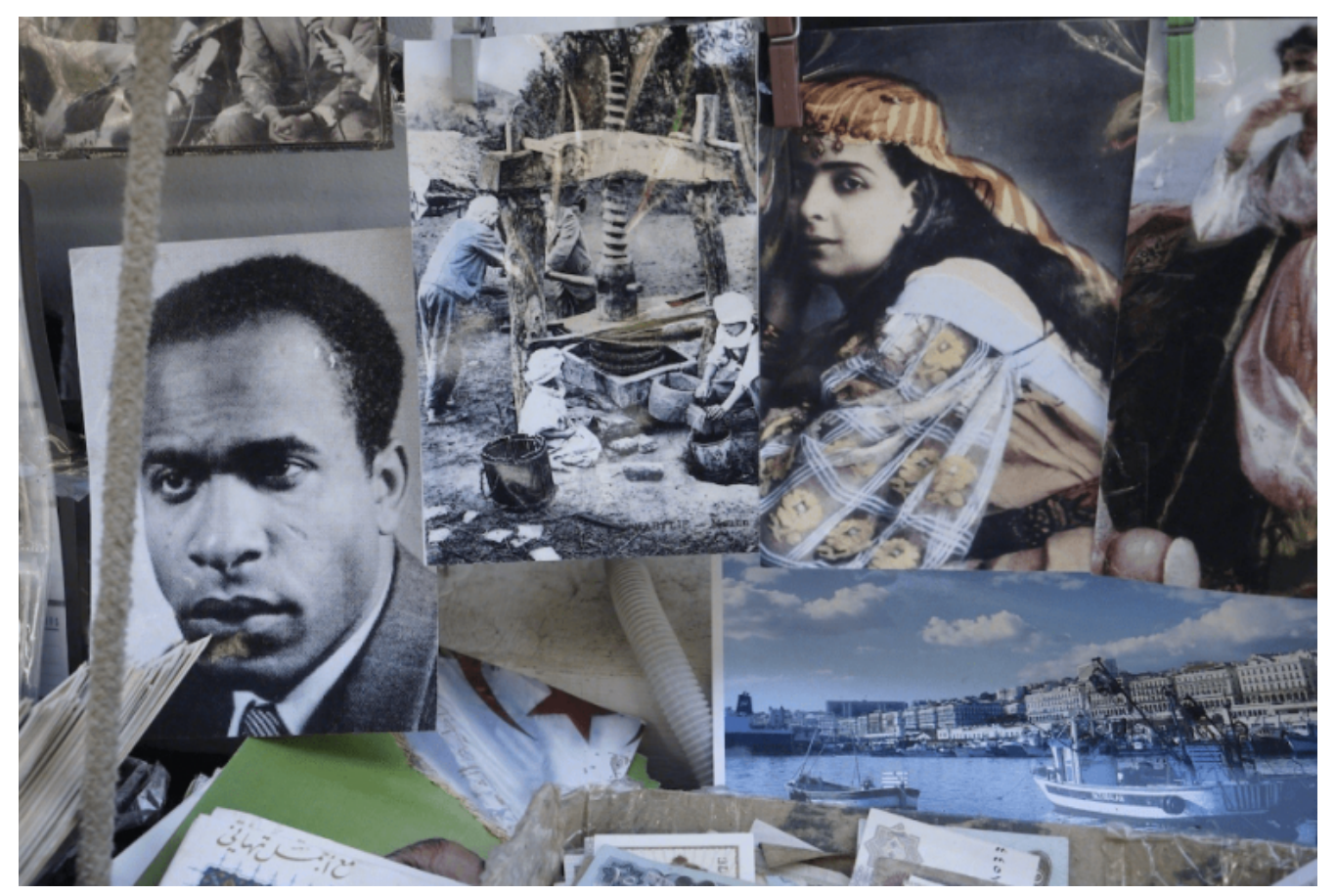
Katia Kameli, L'Oeil se noie (2016), Courtesy of the artist and Tiwani Contemporary.