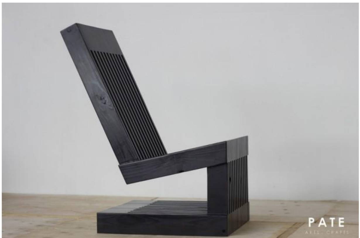
Siyanda Mazibuko Pate arts and crafts, Furniture designer, South Africa.

AS: How do you access the situation with the growing African elite in Nigeria and South Africa, etc. and how can they play a role of real drivers of the creative fields?