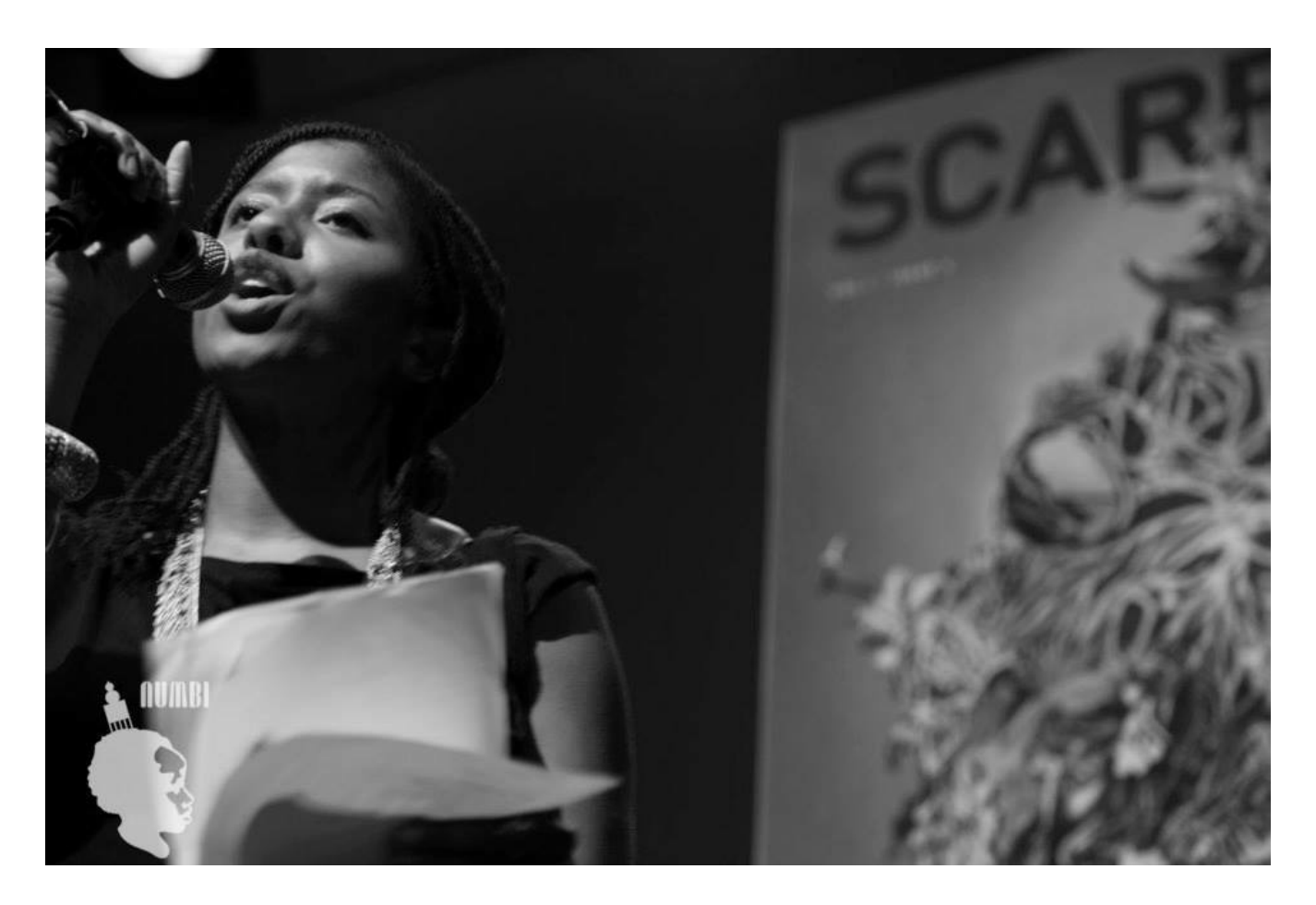
Numbis Scarf magazine launch @ Rich Mix.

Three decades have passed since then, but the sweet harmony, complicity and cheerfulness that accompanied our little adventures and marked our coming of age are still alive.