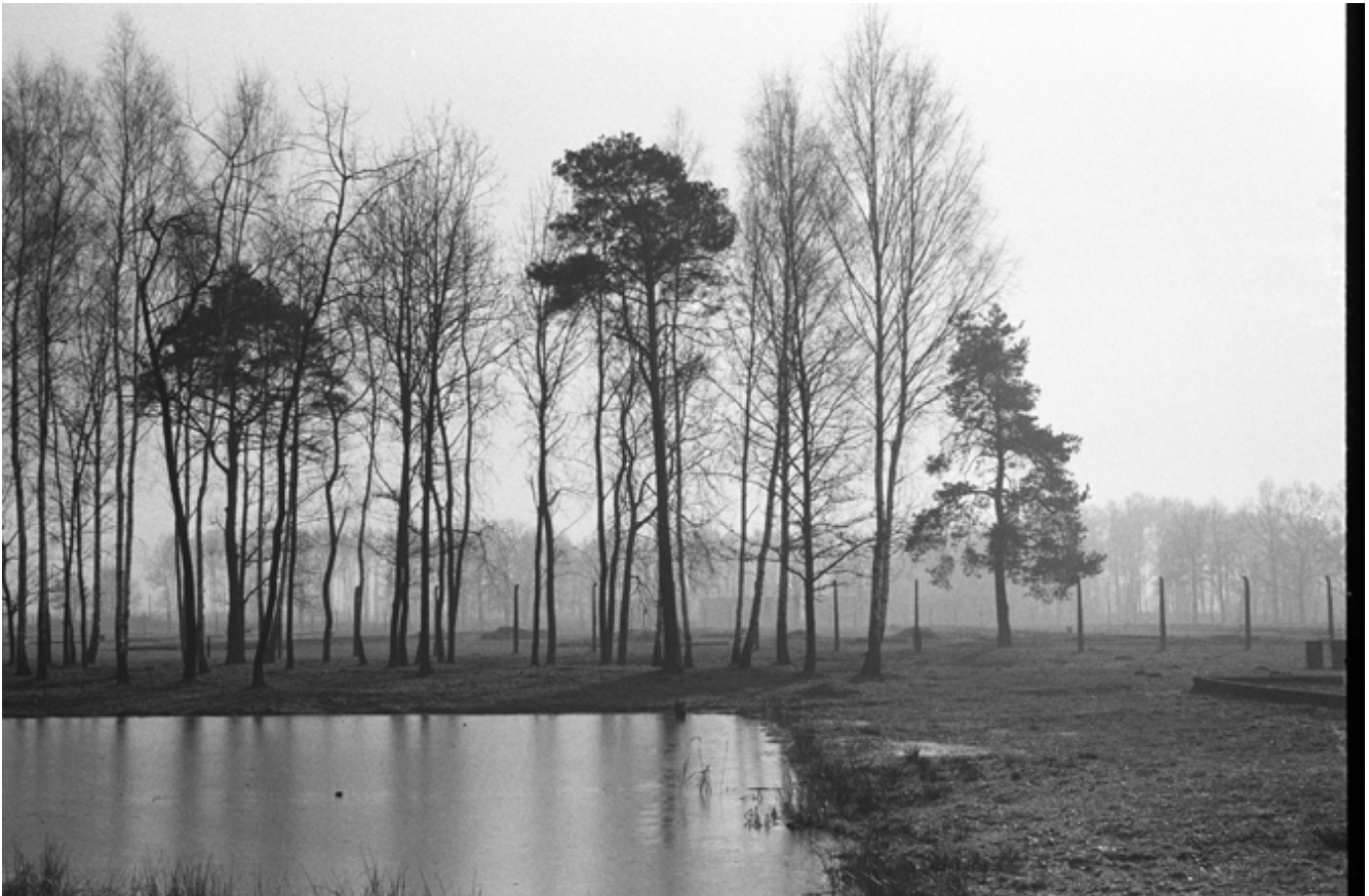
Lake Once Filled With The Ashes of tThe Cremated, KZ2-Auschwitz / 1997 silverprint edition 5

cognitive process that Mofokeng describes as follows: “What is not in the photograph is in the memory, in the mind,” something that the viewer can relate to, based on his/her own experience. Once again, by avoiding any spectacular representation of suffering, he makes memory-charged places even more ambiguous and capable of transcending borders and geographical distances: see the placid, tree-lined lake where the ashes of thousands of concentration camp inmates were thrown; or Auschwitz railway tracks, wrapped in the winter fog, seen from above and from a distance, almost with no emotional attachment.