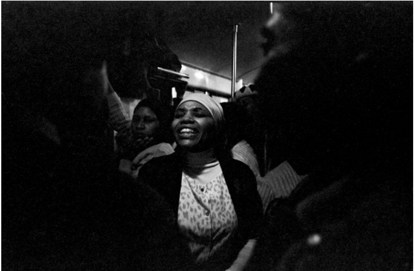
Exhortations, Johannesburg - Soweto Line / 1986 silverprint edition 5

beams of light and shadows making their bodies evanescent, suspended in a timeless atmosphere.